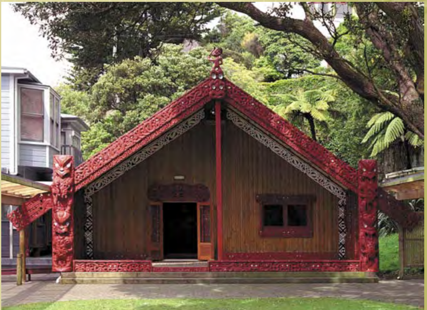
Ko Te Tumu Herenga Waka.