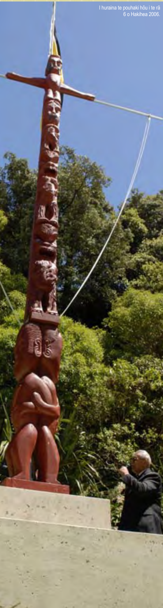
I huraina te pouhaki hōu i te rā 6 o Hakihea 2006.