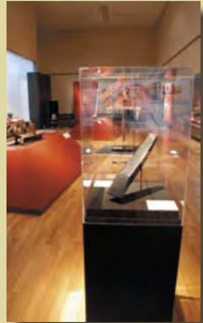
Ngā taonga i Hapani

Ko te tūmanako, ka hoki ngā taonga ki Te Papa Tongarewa mō te wā poto. Ā tōna wā pea, ka tukuna anō ki te ao.