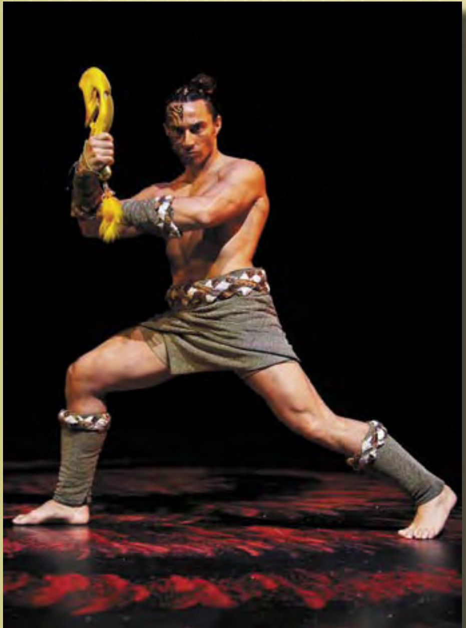
Ka rere te patu a Māui!

'He tukemata anō tō te taonga'. Ko te take i kōrero pēnei ai au, ko ngā whakaaturanga o rāwāhi inā noa atu tōna rahi, inā noa atu tōna utu ki tō Māui. Engari hei aha atu. Ko tēnei whakaaturanga he pērā tonu tōna āhua, kei runga noa atu pērā i ngā mea o rāwāhi. Ki tō Tānemāhuta whakaaro, kua tae ki te wā kia kite, kia rongu te ao whānui i ngā kōrero ake a Ngāi Māori.