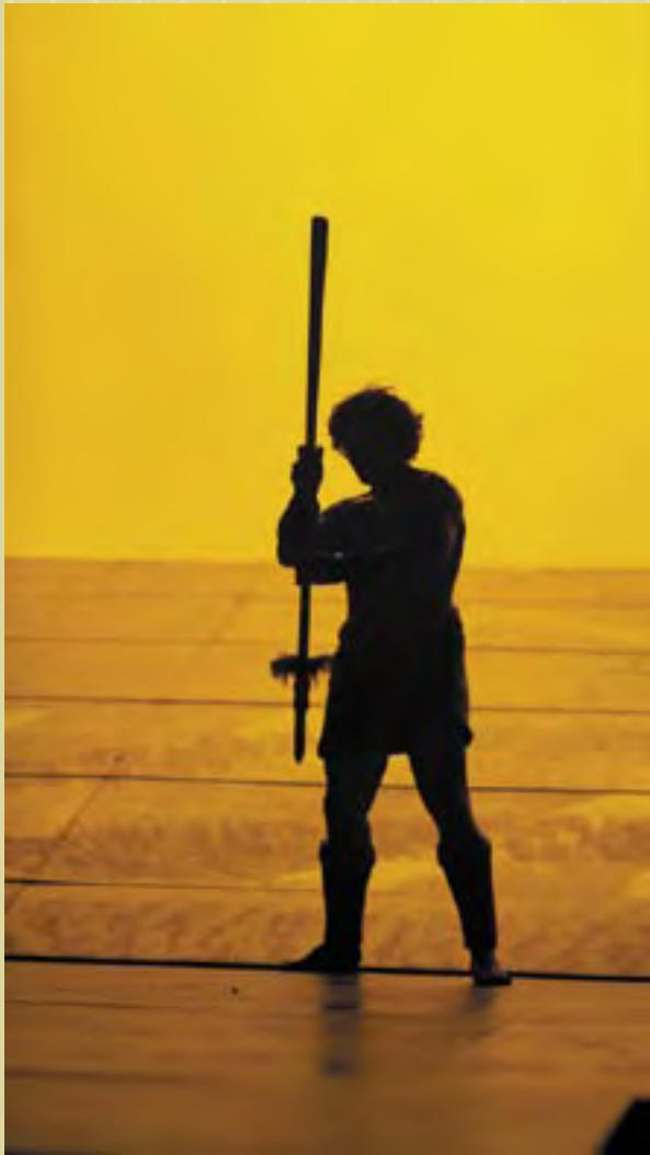
Ka tū whakaio a Māui