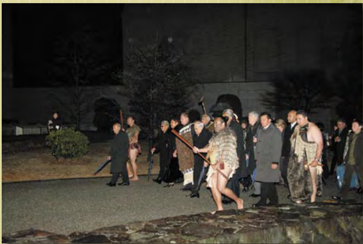
E whakaeke ana ngā tāngata rongonui o Aotearoa ki te Whare Taonga i Hapene