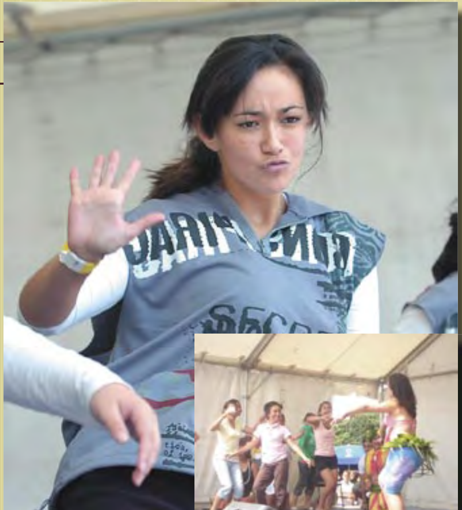
Kei te kanikani Hip Hop tēnei kaikanikani

Ka tīmata tēnei kaupapa hei whakanui i ngā rangatahi me ō rātau wawata, kia puāwāi haere rātau i roto