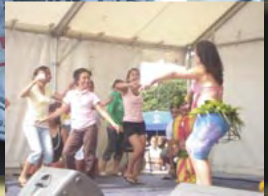
Kei te kanikani ngā tamariki me tētahi o ngā kaikanikani

i ēnei āhuatanga o te kapa haka, te kanikani Poroneihana me ngā waiata hoki o te Hip Hop.