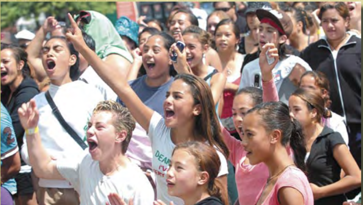
E manahau ana te hunga matakitaki

Ka kite mātou i ēnei taonga e taea ai te whakatipu i a rātau kia kore ai rātau e taka ki te hē.