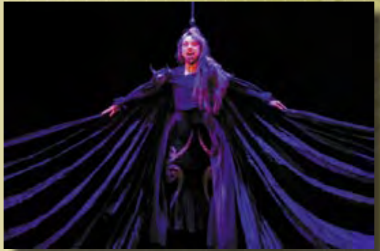
Ko Hine nui Te Pō