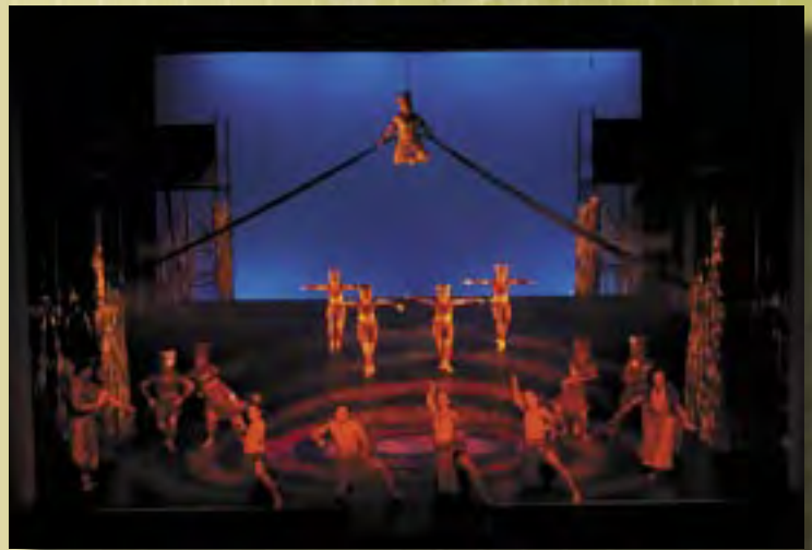
Kua mate a Māui

Tāmaki Makaurau The Civic at THE EDGE 18-29 Paenga-whāwhā 2007 Ticketek: 09 307-5000 www.ticketek.co.nz