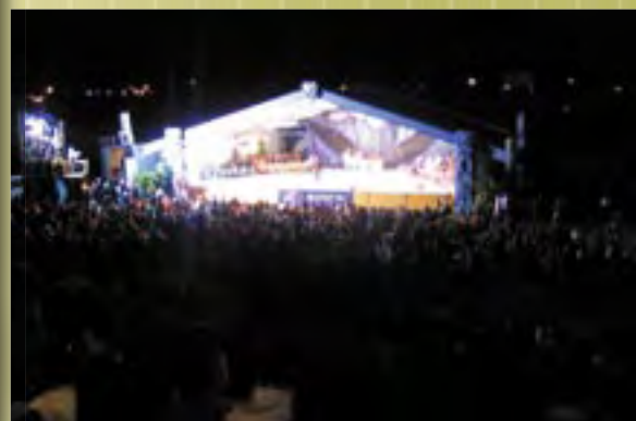
Te pō whakawhiwhi tohu o Te Matatini 2007